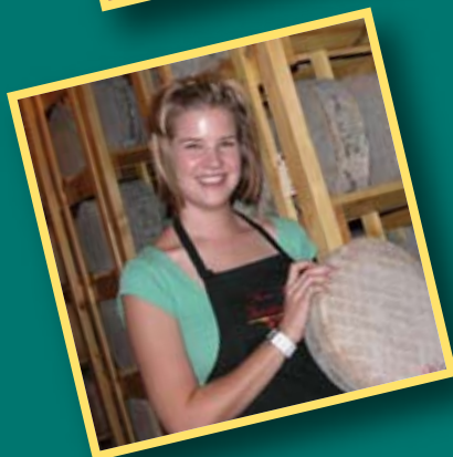
Three Sisters Farmstead Cheese