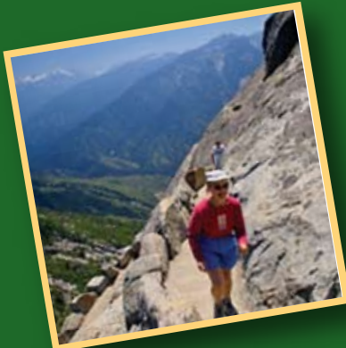
Hiking Moro Rock

The Visalia Convention and Visitors Bureau is proud to present the Eco-Tourism package that will guide tourists through the eco-friendly sites of Visalia.