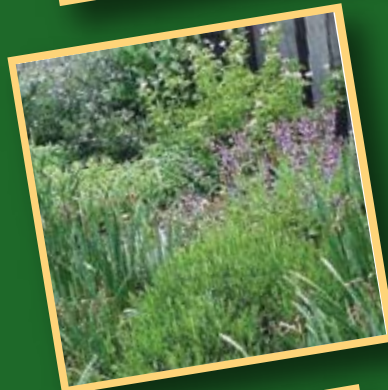
Farm To Fork Culinary Tour