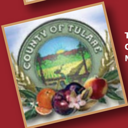
Tulare County Museum